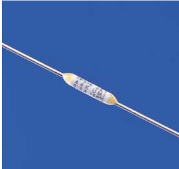
The photo of 44K is shown.